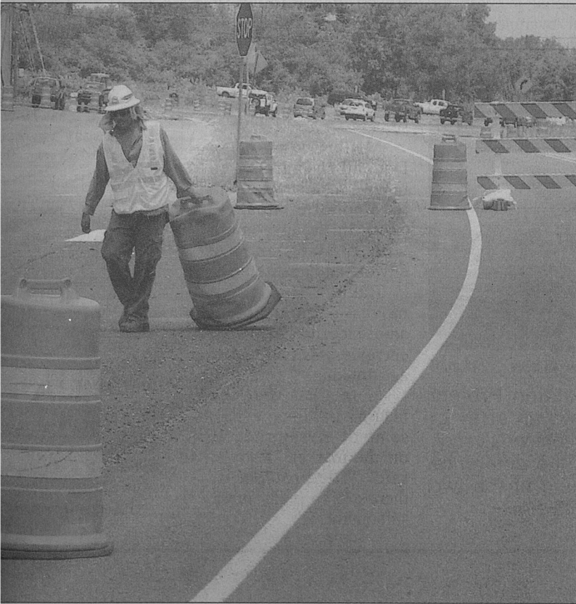
Javier Vega with CW Matthews Contracting Co. moves barrels blocking Hwy. 141 as traffic shifts to a new section of road Tuesday.